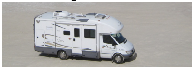
The View at White Sands National Monument.